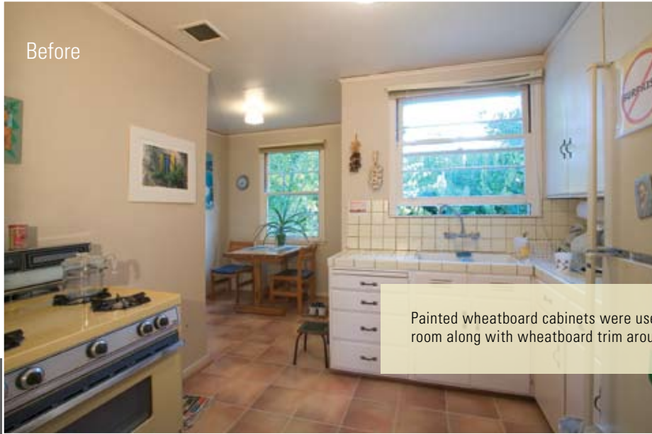
Painted wheatboard cabinets were used in the kitchen, bathrooms, utility room, living room along with wheatboard trim around the windows and doors.

This project is a great example of how to meet the goals, strategies and budget of the entire “green team.” It also showcased what is needed to transform any small, leaky old house into a tight state-of-the-art energy conserving, resource frugal, and nontoxic house that promotes the health and well being of the environment and most importantly, the family. | QR