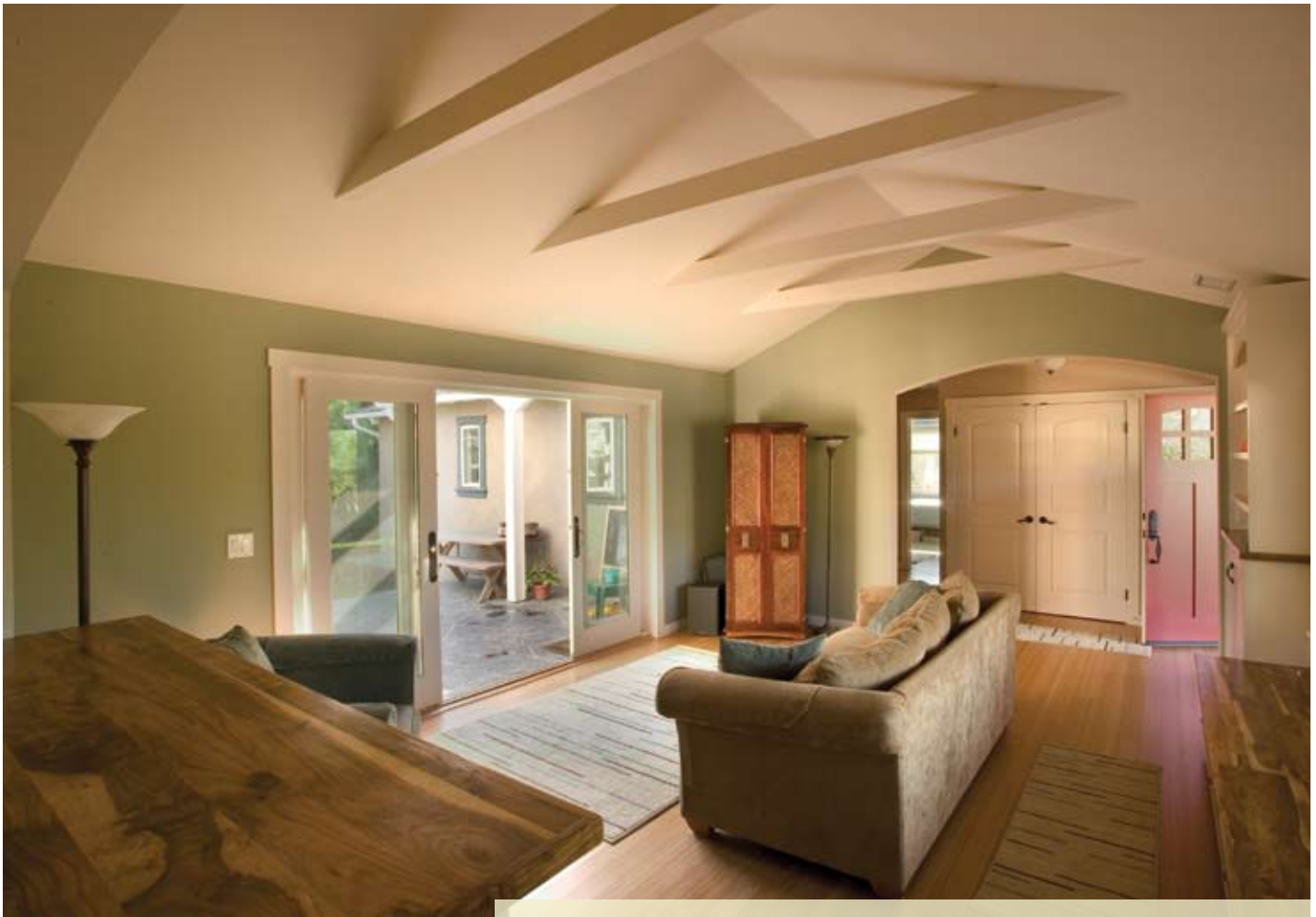
The new cathedral ceiling adds a feeling of spaciousness while a new French door adds warm sunlight to the remodeled living room.

wall framing is being preserved,” explains Karen Feeney, Green Resource manager for Allen Associates. Surprisingly, an existing fireplace — an item that typically serves as a focal point with considerable aesthetic value — was removed from the center of the south living room wall. It was replaced by a wall of French Doors. This glazing transforms the living room into a passive solar collector in wintertime. Double layers of 5/8” drywall were installed in the core of the house to increase thermal mass and dampen temperature swings from the free solar heat.